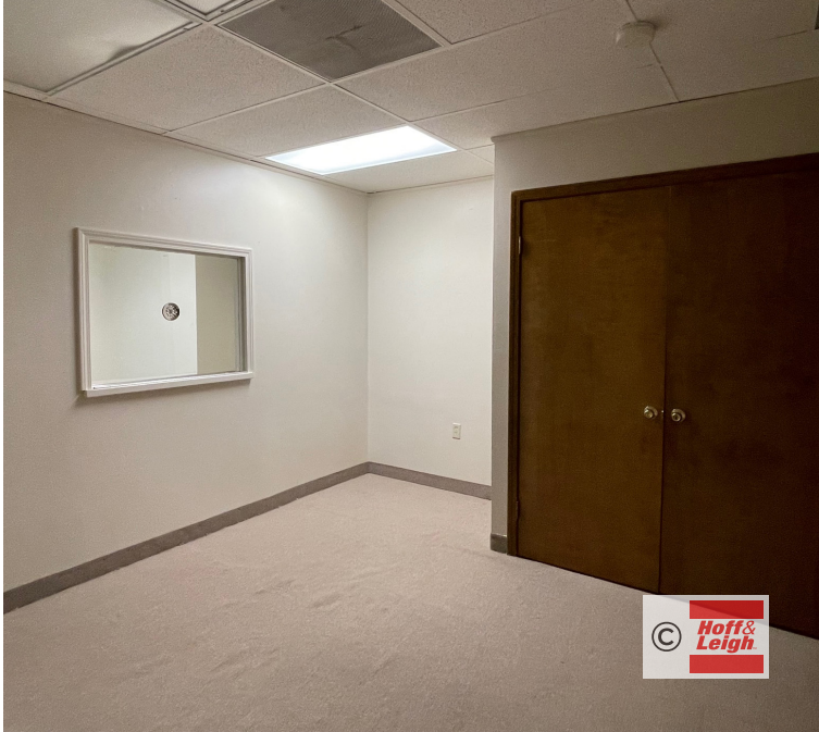
SUITE 310 / 312